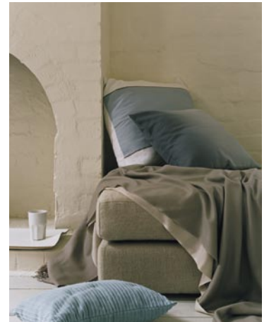
This page (clockwise from top left): Country Road Carry Bag; Melbourne Central Entrance; Homewear Spring 04; Womenswear Spring 04; Kidswear Spring 04; Menswear Spring 04.